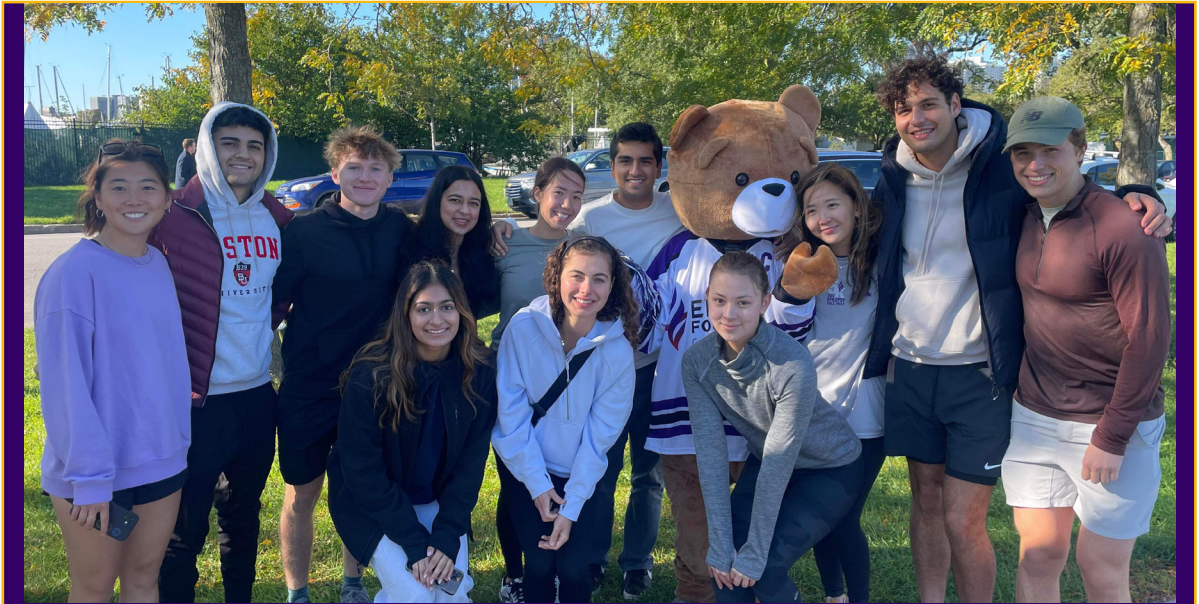
CHICAGO participated in the Epilepsy Foundation of Greater Chicago's 5K Fall Fest Walk. The brothers bonded together while raising donations to support ongoing research and treatments.