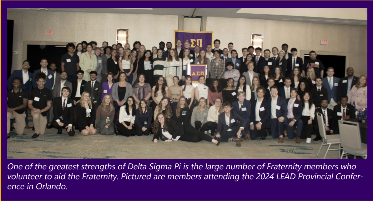
One of the greatest strengths of Delta Sigma Pi is the large number of Fraternity members who volunteer to aid the Fraternity. Pictured are members attending the 2024 LEAD Provincial Conference in Orlando.

National and Provincial Committees exist for Professional Development, Alumni Development, Community Service, Scholastic Development and Awards, Organizational Development and Standards. There is also the National Collegiate Advisory Committee, which students can join as collegian members to further the aims and ideals of Delta Sigma Pi. Awards also exists as a regional committee.