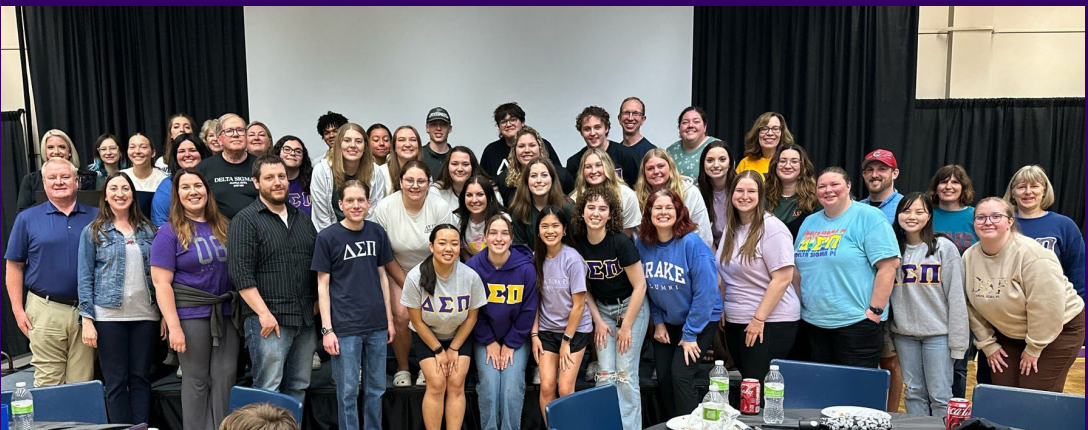
DRAKE (IA) hosted alumni and guests to celebrate 100 years on campus while members connected over Deltasig memories. Delta Sigma Pi provides our members with friendships that last a lifetime, while promoting educational and professional development.

Delta Sigma Pi’s Vision is to be a lifelong community of inclusive leaders committed to creating a world in which everyone can prosper in business and beyond.