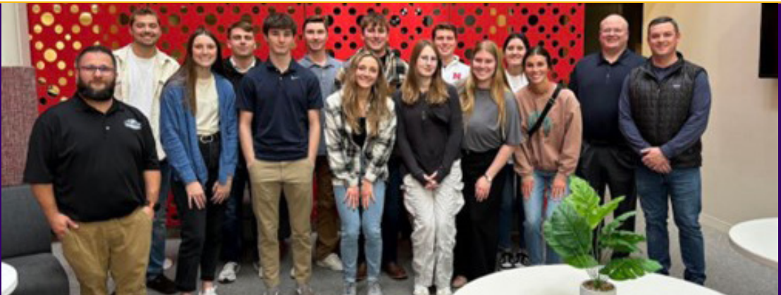
NEBRASKA-OMAHA toured Scooter's Harvest Roasting Facility, learned how the machines are speeding up roasting efficiency and how the products move from facility to store location.