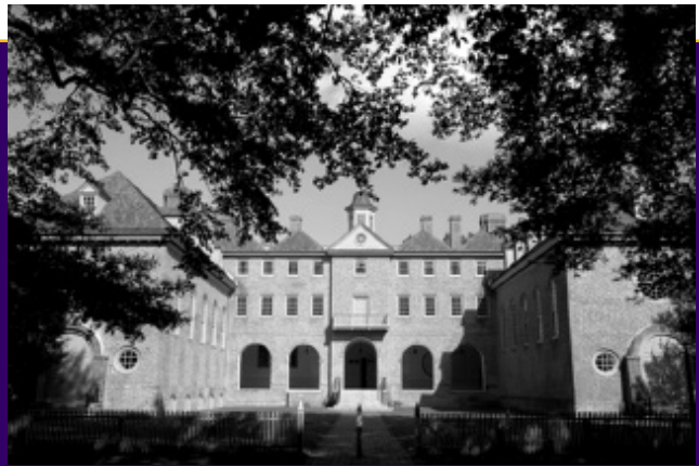
The Wren Building at William and Mary in Williamsburg, Virginia is the birthplace of Phi Beta Kappa. This historic site marks the beginning of the American college fraternity system.

College fraternities are groups of young men and women who are banded together. Phi Beta Kappa had all the characteristics of the modern fraternity, the charm and mystery of secrecy, a ritual, oaths of fidelity, a grip, a motto, a badge, a background of high idealism, a strong tie of friendship and comradeship, and an urge for showing its values through nationwide expansion. While an individual has an opportunity to join various organizations, membership selection and acceptance are based on mutually shared values.