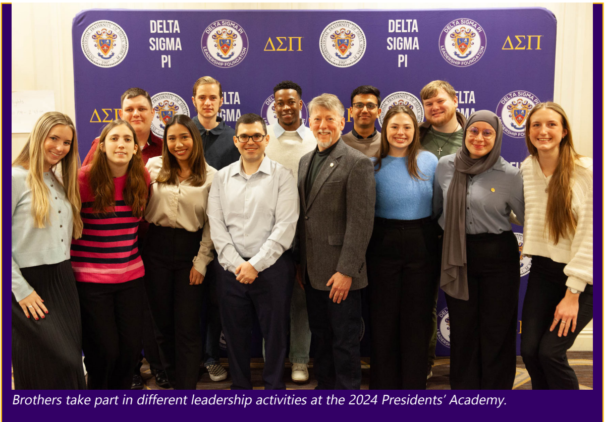
Brothers take part in different leadership activities at the 2024 Presidents' Academy.