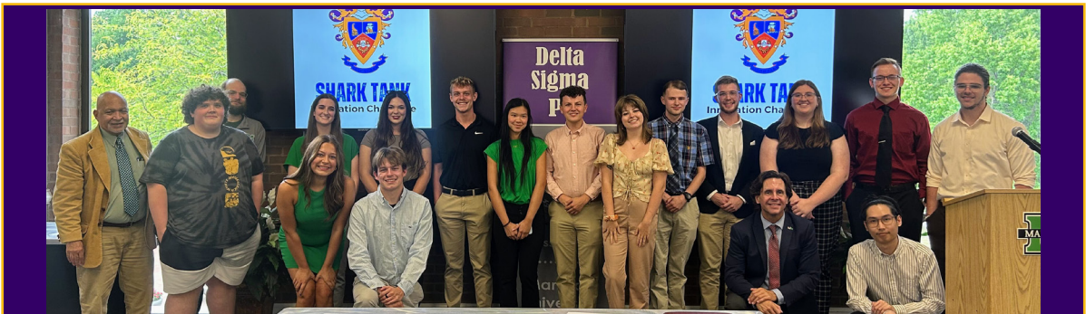
MARSHALL (WV) hosted an Innovation Challenge. With the support of the Lewis College of Business, eight student entrepreneurs pitched businesses to judges for prizes.

University Conduct/Community Standards Office: (Location, Email)