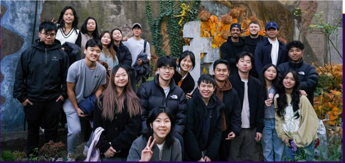
CUNY-BARUCH helped local communities cultivate community gardens. Brothers replaced soil wood chips at Carmen's Garden to prepare for the spring season.