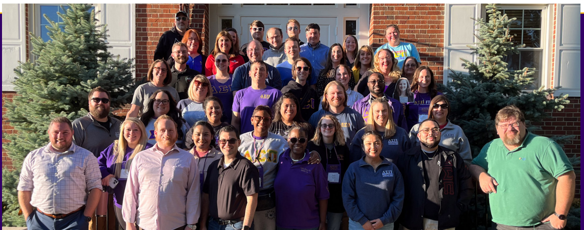
2023-2025 Leadership attended the 2023 Post Grand Chapter Congress Leadership Retreat in Oxford. Deltasis leadership is invested in collegiate brothers' experience and attends events and conferences to connect with chapters and help them succeed.