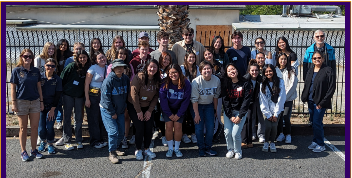
For Make a Difference Day, 45 brothers, potential new members and guests from CALIFORNIA-IRVINE, CHAPMAN (CA), PEPPERDINE (CA), ORANGE COUNTY (CA) and INLAND EMPIRE (CA) participated in the service activities for Santa Claus, Inc.

There are several things to consider when planning an event. This grid on the following page will assist you in event planning. Also use the "Guide for Planning Meetings and Events" on dsp.org as an additional resource for things to consider, by visiting this link .