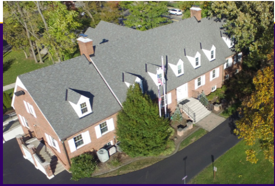
The Central Office of Delta Sigma Pi, located at 330 South Campus Avenue, Oxford, Ohio, was built in 1956, with two wings added in 1970. Extensive renovations completed in 2010 made the building more functional and accessible for all brothers.

The Fraternity database contains information for every member initiated, as well as historical data and records. The library of the Central Office contains files on schools of business administration in the United States, copies of all issues of The Deltasig magazine and membership records for every member of Delta Sigma Pi from the very founding of the Fraternity in 1907.