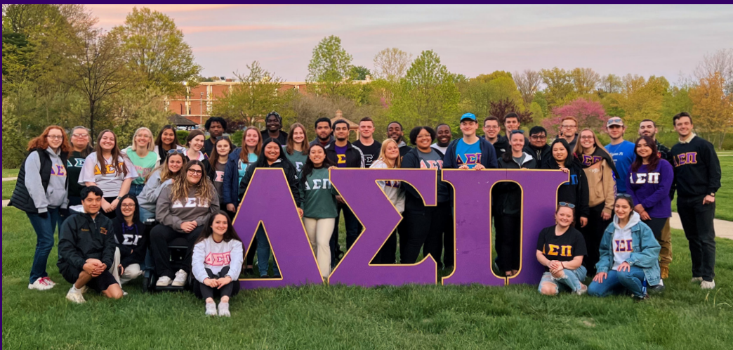
RIDER (NJ) hosted their annual Alumni Barbecue as a gesture of gratitude toward alumni for their continued support and contributions after graduation.